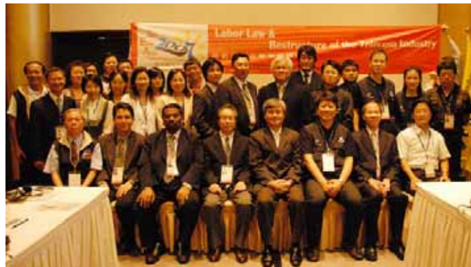
Group Picture of delegations in East Asia Telecom Union Forum

2007 East Asia Telecom Union Forum is held by CTWU in Taipei, Taiwan. Brothers and Sisters from NWJ, KTTU, UNI APRO, PEACH, PCCW, Cable and Wireless Staff Association and APTG Workers' Union attended the forum and exchanged the current situations and challenges in East Asia. At the end of the forum, Presidents of NWJ, KTTU and CTWU signed a joint statement to pledge to cooperate each other and promote the strategic alliance.