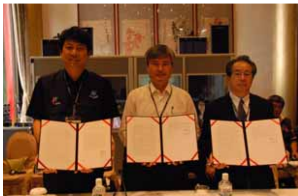
2007 East Asia Telecom Union Forum Joint Statement

To confront this problem, CTWU is now coordinating Taiwan IT Confederation Union, which unites unions in the communication industry. In the future, workers can be protected under this big umbrella.